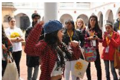
Hip Hoppers 4 Peace – YA2016 opening.