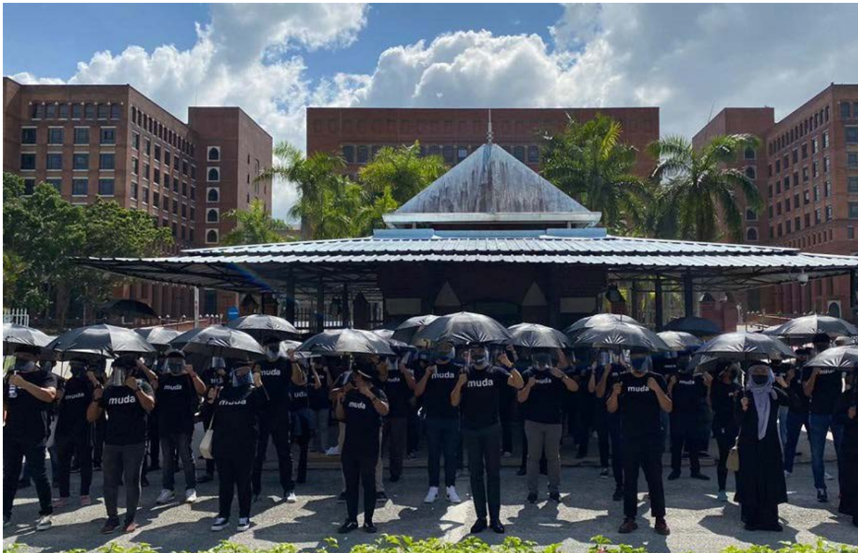
MUDA party members at Registrar of Societies, Putrajaya demanding registration. 21 December 2020, Putrajaya

The legal framework governing the operations of CSOs and political parties remains unduly restrictive and overly burdensome.