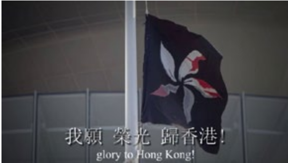
Video of "Glory to Hong Kong" - Anthem of The Hong Kong Protests

There have been multiple incidents of censorship of books, films, plays, songs and video games.