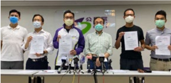
Civic Party members at a press conference

The introduction of the NSL and SNSO has undermined the right to freedom of association, supposedly guaranteed under article 18 of the Bill of Rights Ordinance. These laws have greatly impeded civil society's ability to carry out its work. The entire staff of some organisations quit on the eve of the NSL's introduction. Many civil society organisations, political parties, social movements and trade unions have disbanded or closed their offices. Since 2020, around 60 civil society groups have disbanded or halted operations.