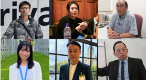
Human rights defenders in exile face arrest warrants

In December 2024, Hong Kong national security police issued a fresh round of arrest warrants for six human rights defenders self-exiled to Canada and the UK. A reward of HK$1 million (approx. US$129,000) was offered for information leading to their arrests. The six are accused of committing national security offences including colluding with foreign forces and inciting secession.