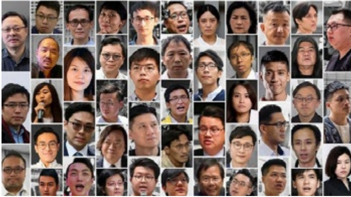
The Hong Kong pro-democracy activists who were detained and sentenced in November 2024

Hong Kong's China-controlled Legislative Council passed a new security law on 19 March 2024, further intensifying repression. The Safeguarding National Security Ordinance (SNSO) contains seven offences: prohibition of foreign political organisations or bodies from conducting political activities in the territory or establishing ties with foreign political organisations or bodies, secession, sedition, subversion against the Central People's Government, theft of state secrets and treason.