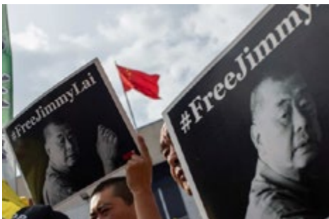
Activists in the US outside Chinese Consulate for imprisoned Hong Kong media entrepreneur Jimmy Lai, February 2026

In a rare move on 6 December 2025, China’s national security arm in Hong Kong, the Office for Safeguarding National Security, summoned international journalists to warn them against spreading false information and ‘crossing red lines’ following critical coverage of the Wang Fuk Court fire.