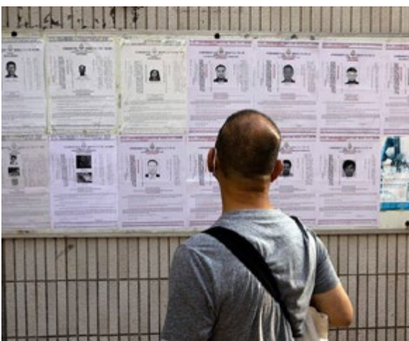
Police reward notices for eight pro-democracy activists living in exile

There have been increasing cases of transnational repression, with the Hong Kong government seeking to target human rights defenders in exile and their families at home.