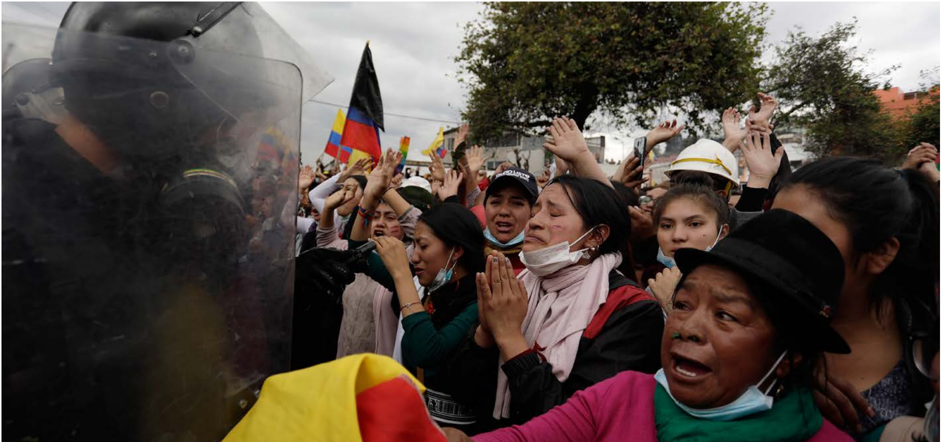
Indigenous women call for the police to behave peacefully during protests against the economic measures imposed by the Ecuadoran government in October 2019.

the widespread rejection of these by protesting masses, international financial institutions seem as wedded as ever to economic neoliberal policies and austerity packages, pushing them on states – including Ecuador and Haiti – in return for granting financial support. Austerity policies are being foisted on countries of the global south even though they and the theories behind them have been tested in Europe and elsewhere and have become discredited and been rejected by states and citizens in countries in which they have been applied.