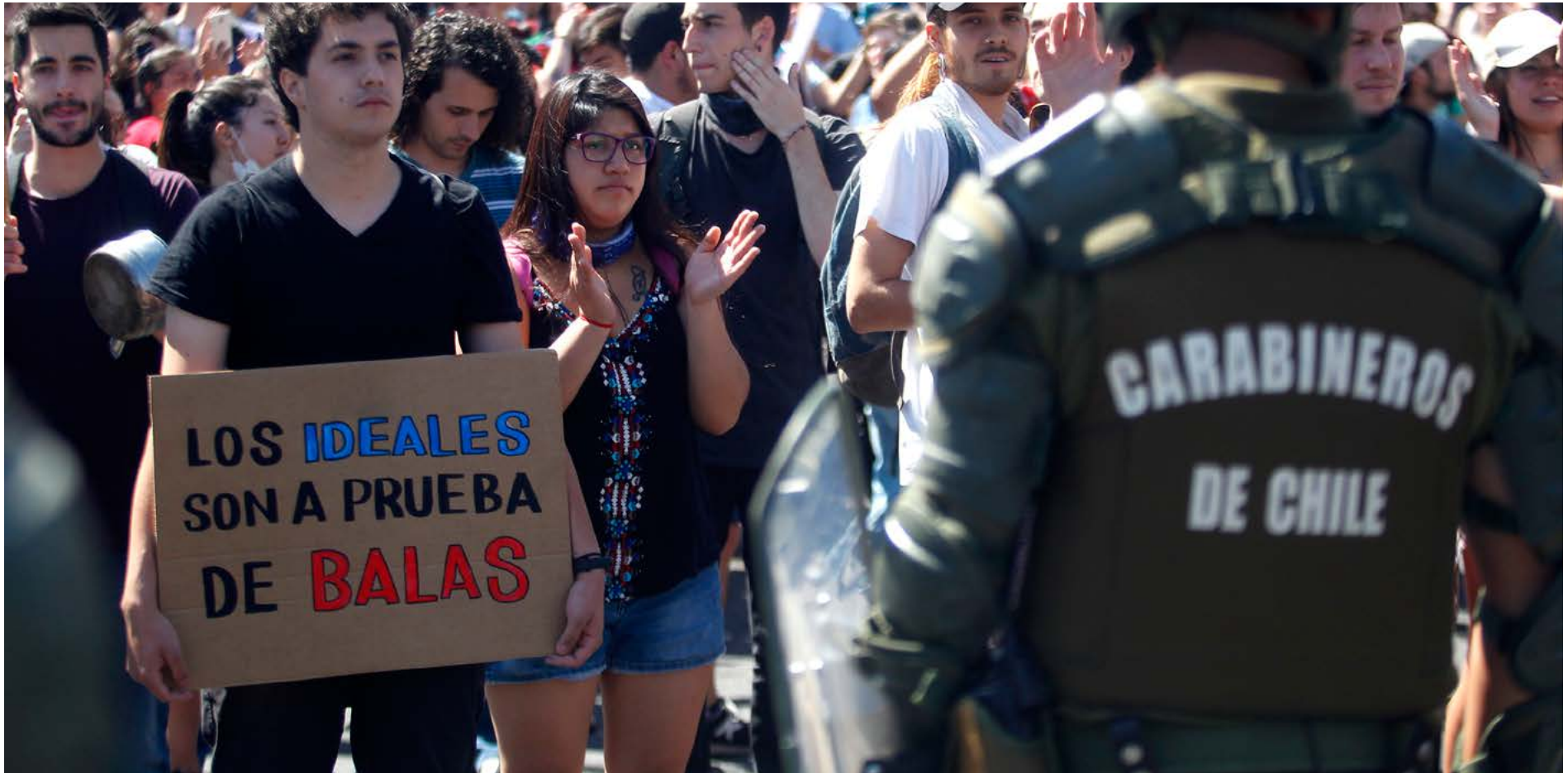
A demonstrator holds a banner that reads 'Ideals are bulletproof' as he stands in front of a riot police barricade during the fifth day of anti-government protests in Santiago, Chile in October 2019.

measures. These measures were accepted and naturalised by a citizenry that was in a state of shock and repression.