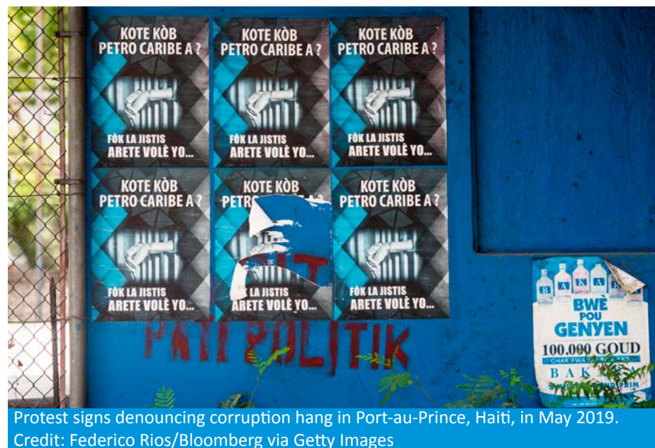
Protest signs denouncing corruption hang in Port-au-Prince, Haiti, in May 2019.

And after all the unrest, still no one has been held to account for the vast corruption. No money has been returned and no one has gone to jail. Understandably, the anger that triggered the protests remains. People deserve answers, and they deserve justice. They will continue to ask 'Kot kob Petrokaribe?'