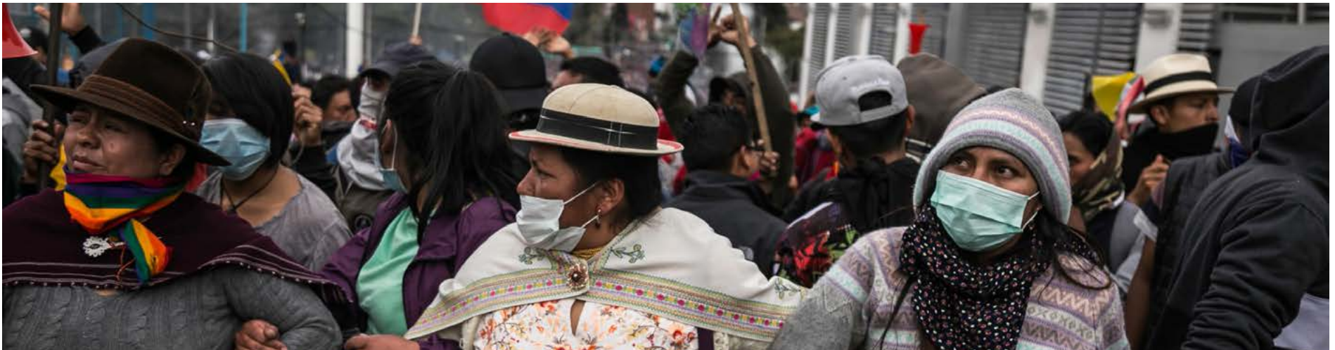
Indigenous protesters, including many women, demonstrate outside the National Assembly in Quito, Ecuador.

Many in civil society will continue to call for alternatives to economic neoliberalism and externally imposed austerity. On 16 October, in the context of the World Bank and IMF annual meetings, 35 CSOs from around the world signed a declaration against IMF-backed austerity policies, pointing to the upheaval caused in Ecuador and Haiti (see below), among others, and asserting the need to respect human rights and ensure the participation of civil society and the groups most affected by economic changes. Without such changes, the disruption seen in Ecuador can be expected to be repeated elsewhere.