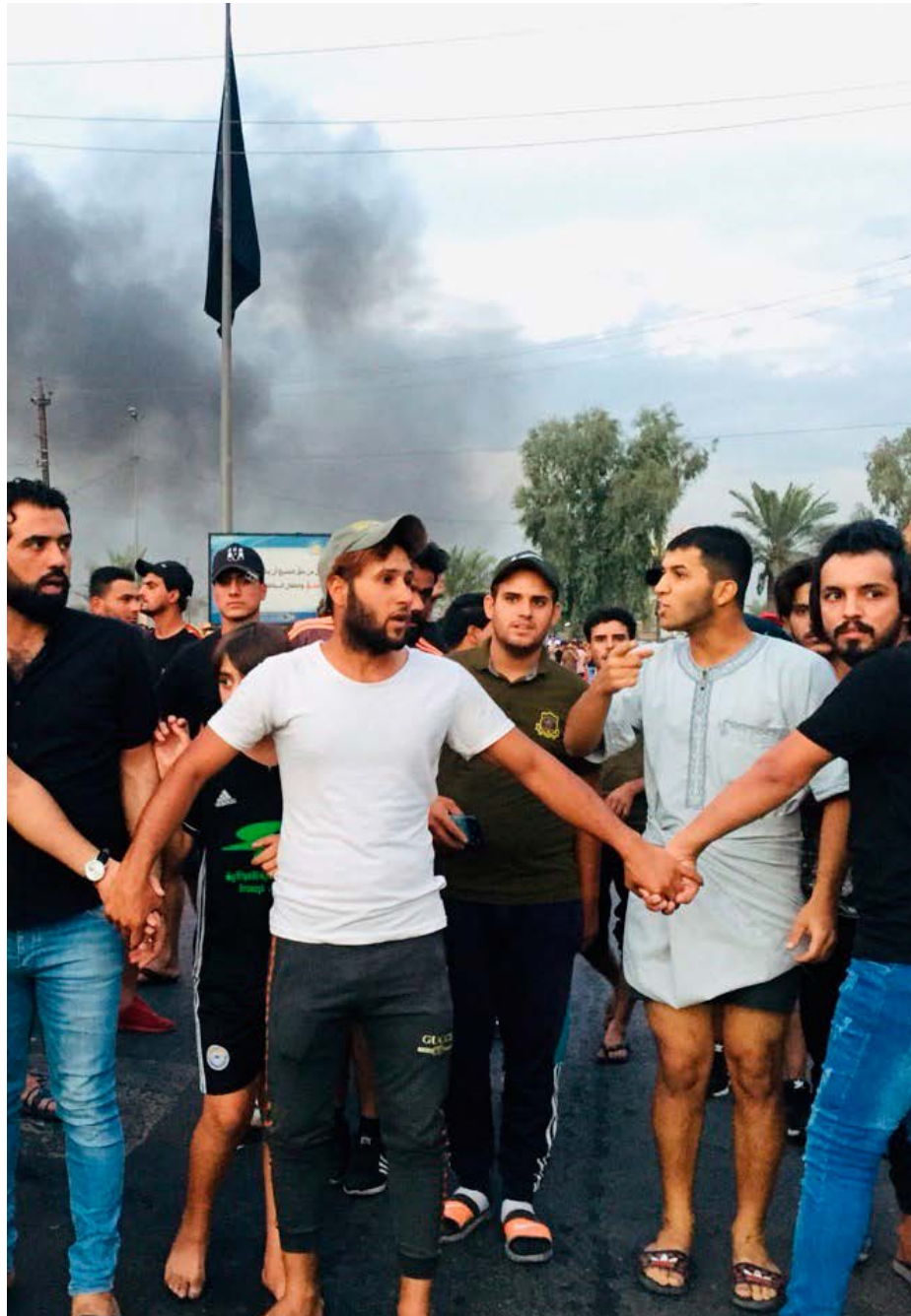
People protest against unemployment and corruption in Baghdad, Iraq on 7 October 2019.