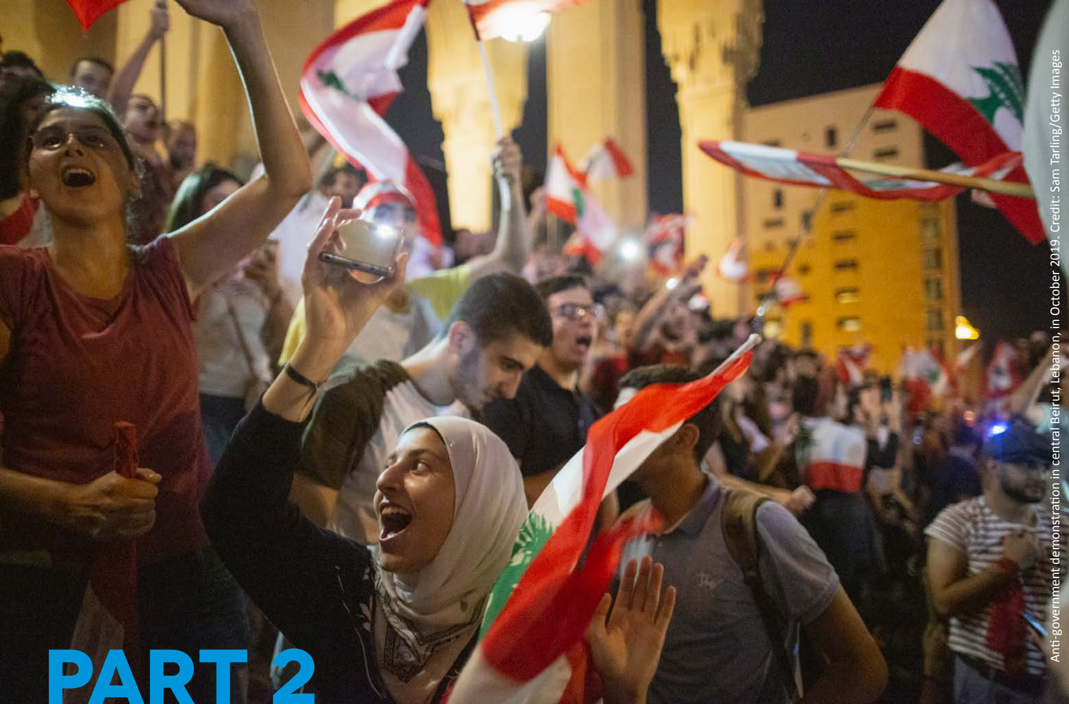
Anti-government demonstration in central Beirut, Lebanon, in October 2019.