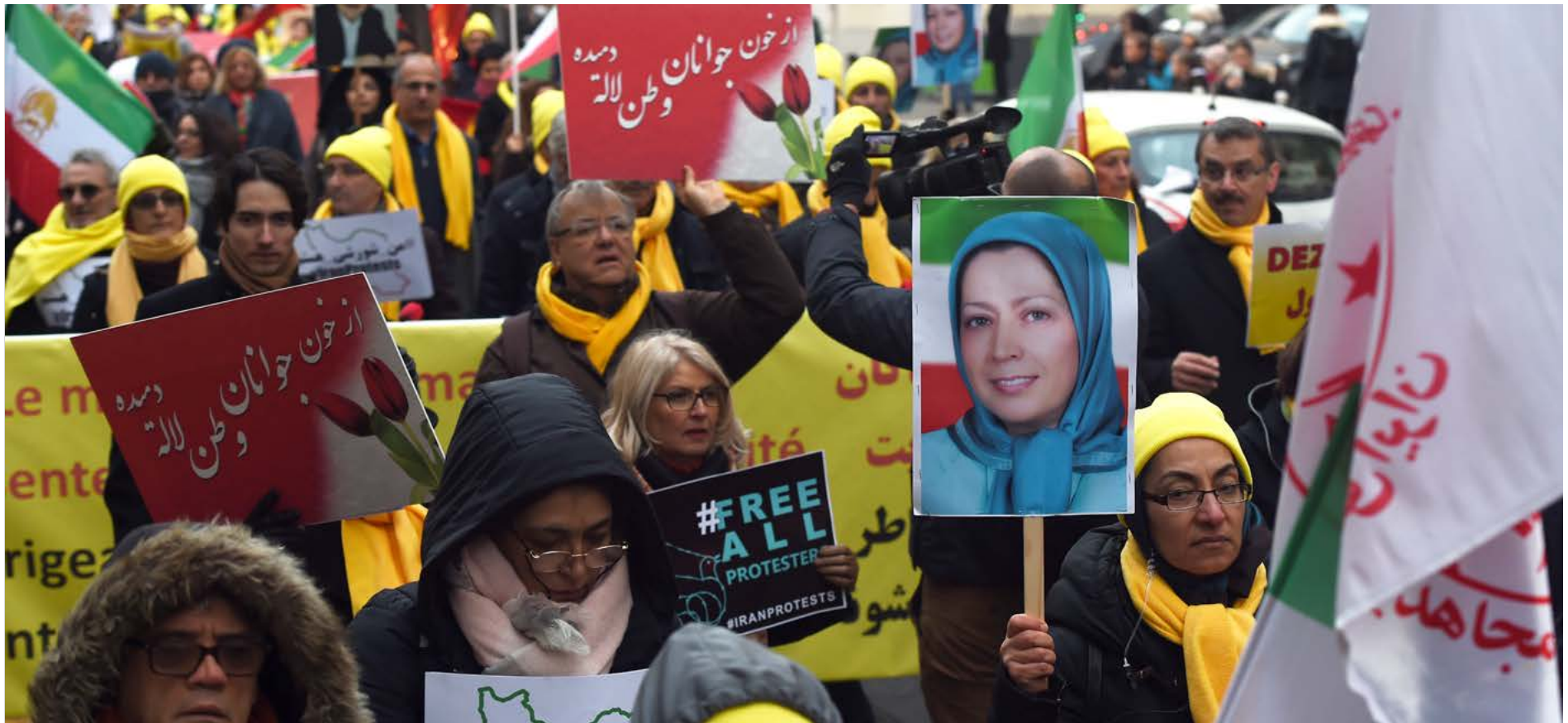
People in Paris, France, demonstrate in support of the uprising and against repression in Iran in December 2019.