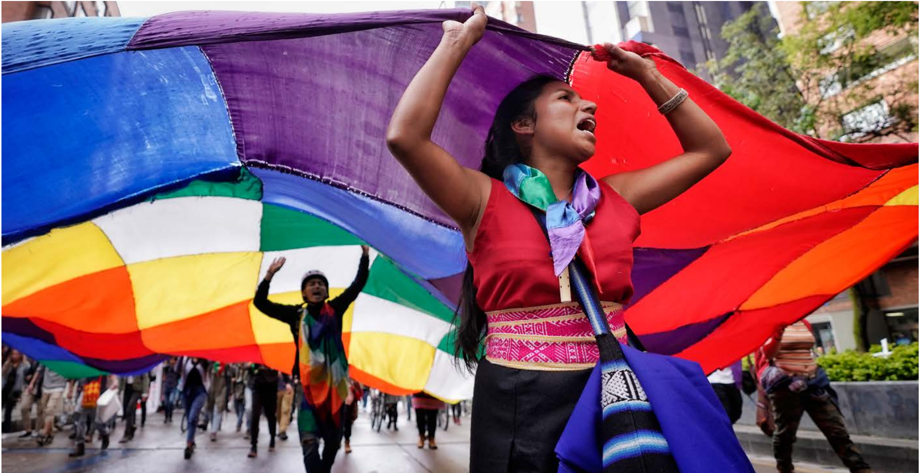
Members of Indigenous communities carry a giant Whipala flag during an anti-government protest in Bogotá, Colombia, in November 2019.