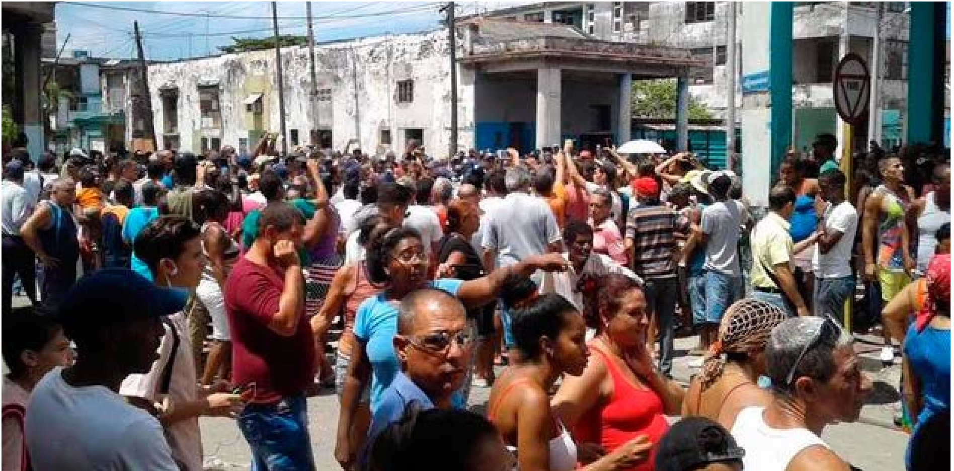
People protest in the El Cerro neighbourhood, Havana, Cuba to demand the restoration of electricity and water services.

ready to go to public protests, they decided to give them what they demanded, in order to prevent an outburst and to take credit for the result, although this would never have been achieved in the absence of citizen pressure. They showed their preference for occasional win-win solutions to avoid the danger of a viral contagion of protests among a population that is fed-up with broken promises. Each popular victory teaches citizens that protesting and demanding – rather than begging and waiting – is the way to go.