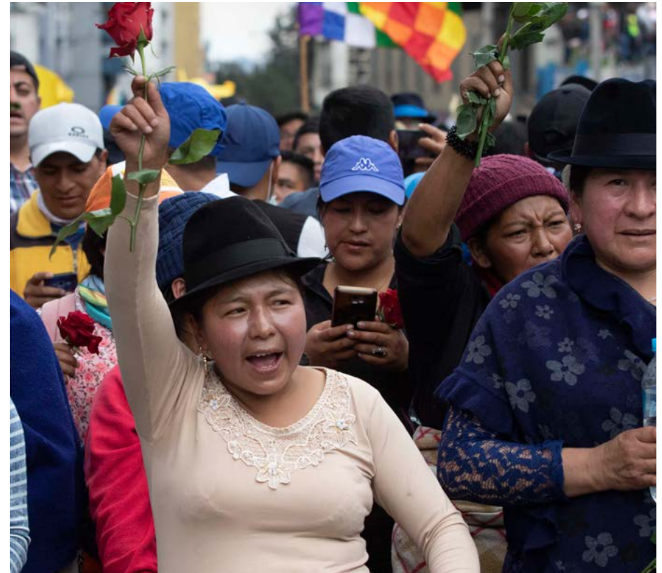
Members of Indigenous communities protest in Quito, Ecuador, against the end of fuel subsidies.

For the sake of all those killed, injured and abused during the protests, civil society will continue to mobilise, participate and urge real progress; further mass protests can be expected if the government falls short on people's high expectations.