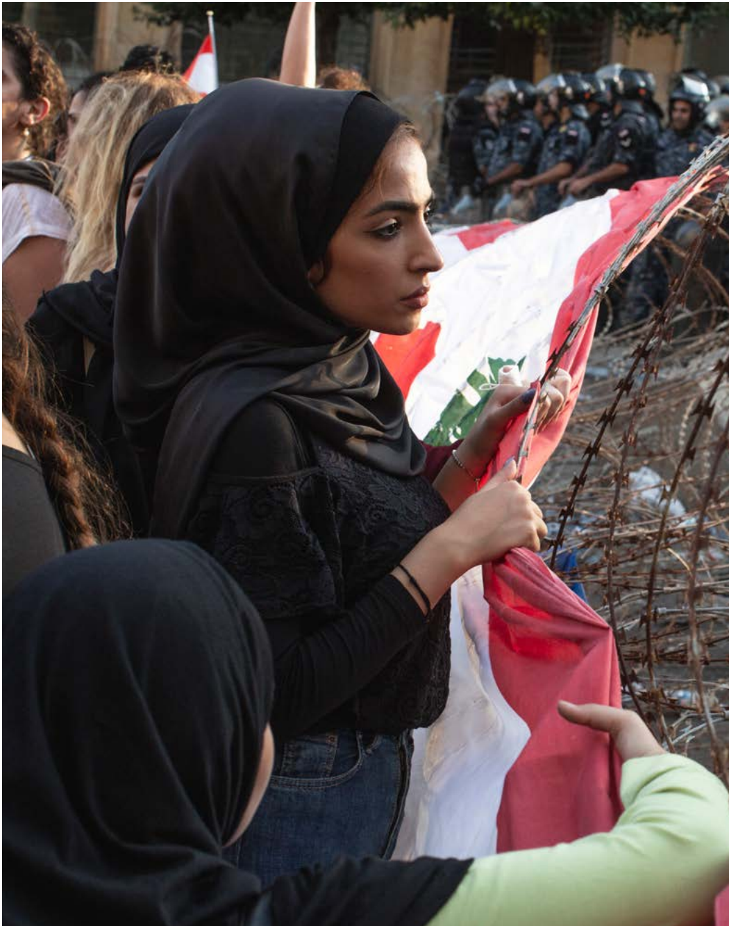
Women protesters stand between riot police and demonstrators during a protest in downtown Beirut, Lebanon, on 19 October 2019.

On the same day, supporters of the Amal and Hezbollah movements violently clashed with peaceful protesters in Beirut and other regions. Violence increased, a fact that was firmly condemned by UN experts and special rapporteurs, who called on the Lebanese government to respect the right to the freedom of expression and protect protesters.