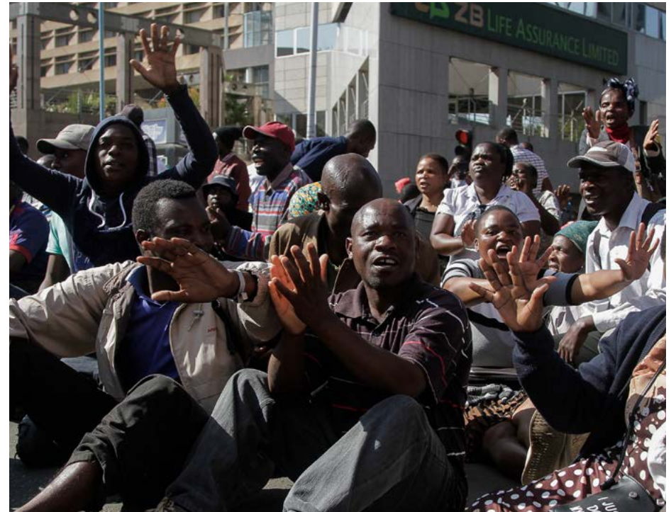
Demonstrators sit and sing protest songs after police cordon off a street on 16 August 2019 in Harare, Zimbabwe.

Meanwhile, as living conditions deteriorated for all but the wealthy elite and inflation soared once more, civil servants protested over their pay, amidst a heavy police presence, and doctors in Zimbabwe's two leading hospitals went on strike ; in November, in an attempt to break the strike, the government fired 286 doctors. But before then, they had sent an