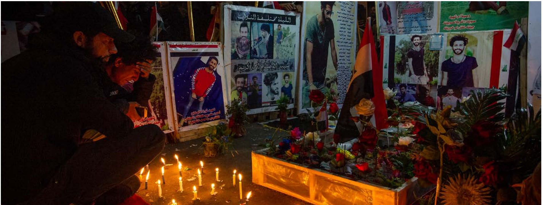
Anti-government protesters light candles in Baghdad, Iraq, to mourn those killed as nationwide protests enter a third month on 6 December 2019.

Whichever candidate eventually prevails will have to be acceptable not only to various political factions but also to Iran. Whether they are acceptable to the many people who protested seems to be a question the ruling elite is less concerned about. The process of appointing a new prime minister is not one that the many young people who continued to protest into 2020 have any say in, and whoever is appointed is unlikely to satisfy them. Whoever becomes the country's next leader can expect to face continuing protest pressure to make real progress on tackling corruption, creating jobs, redistributing wealth and opening up democratic and religious freedoms. That is a full agenda, to which surely now will be added another demand – that of delivering real justice for the hundreds of people who have been killed by a system that refused to listen. A continuation of governance as usual cannot be expected to provide the answers.