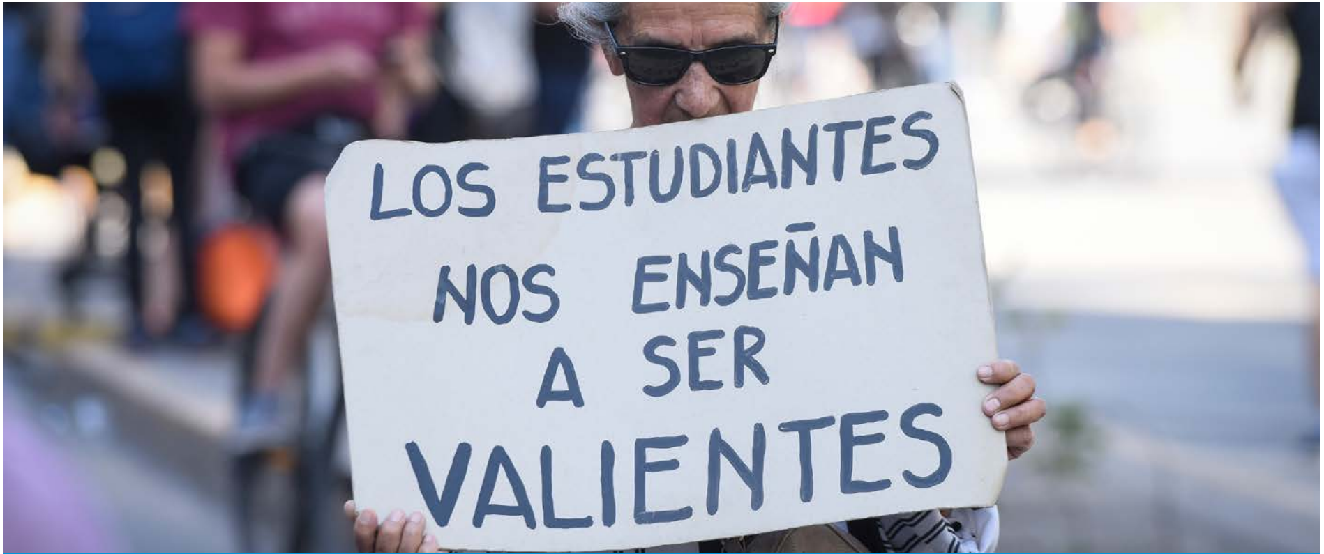
A demonstrator holds a sign that reads 'Students teach us to be brave' during the anti-government protests in Chile.

The Community of Solidary Organisations called for a new social contract to be achieved through democratic dialogue, and as the protests wore on, attention turned to demands for fundamental constitutional reform. The pressure from civil society paid off. By mid-November, all major political parties had agreed to a referendum to trigger a process to replace the Pinochet-era constitution, which entrenches many of the policies that fuel inequality. Although President Piñera initially proposed that Congress would take charge of the process, further pressure forced him to give the public a clear role. In a referendum , initially scheduled for April 2020 but postponed due to the COVID-19 pandemic, people will be able to vote on whether they want a new constitution and, if so, whether they want it to be drafted by a mixed citizen-legislator convention or by one entirely made up of elected citizens, in the citizen assembly model practised successfully elsewhere, notably Ireland .