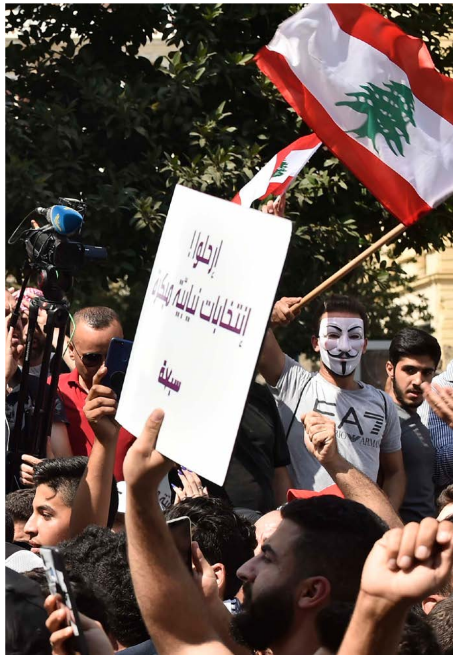
People protest against increasingly difficult living conditions in Beirut, Lebanon on 29 September 2019.

Given people's commitment to sustained engagement and the radical solutions they were demanding, it was no surprise that protests continued into 2020 , as did the use of excessive force by security forces. On 21 January 2020, after months of negotiation, Hassan Diab took office as Lebanon's new prime minister, positioning his new cabinet as technocratic; many disagreed, seeing the ongoing influence of sectarian political parties, and continued to demand a truly technocratic government, fresh, non-sectarian elections and real action on corruption. So far those demands remain unfulfilled as the ruling class appears to be attempting to reassert its hegemony, but a new generation of protesters is unlikely to fall silent.