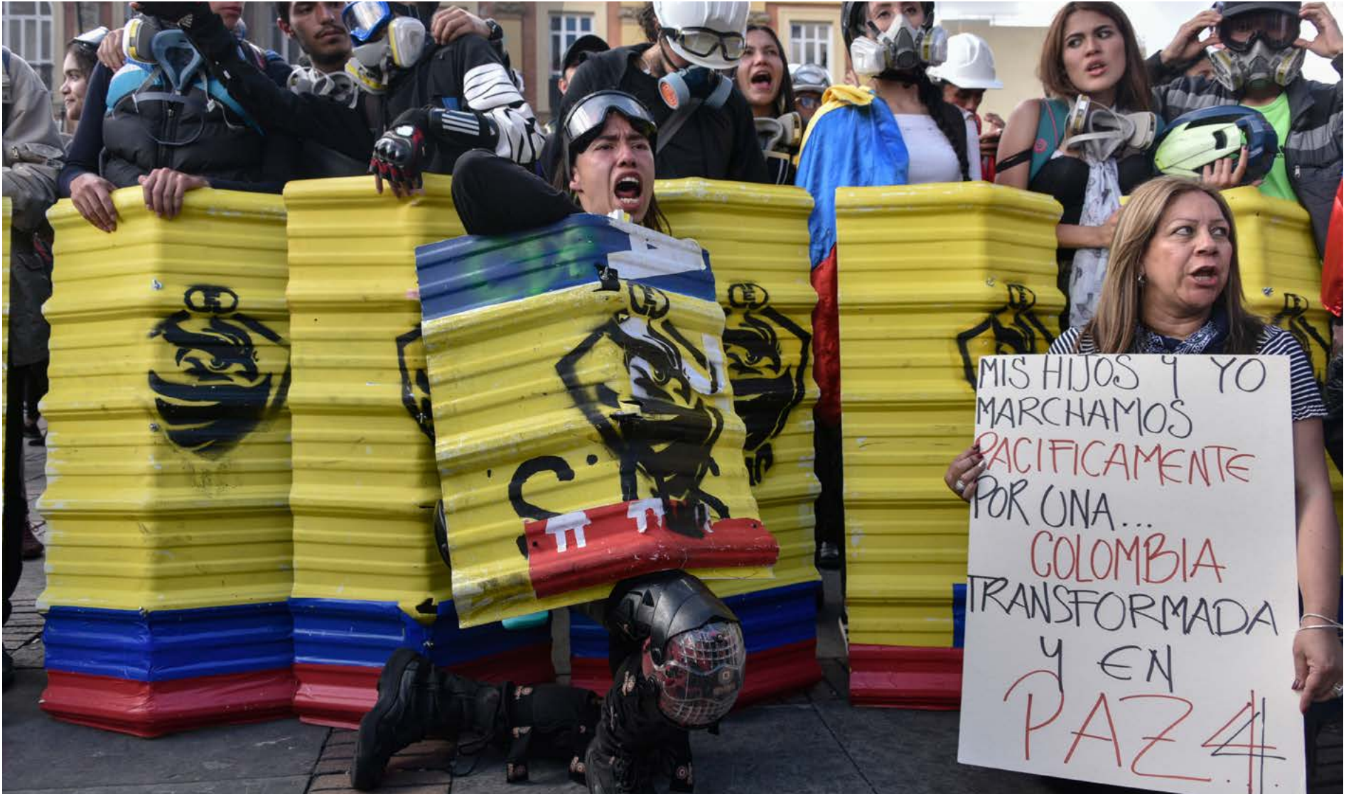
Students hold makeshift shields as they shout slogans during anti-government protests on 4 December 2019 in Bogotá, Colombia.

rights; the rights of Mother Earth; political rights and guarantees; agricultural and fishery issues; compliance with agreements between government and social organisations; withdrawal of legislation; the repeal of specific laws; and reform of the law-making process.