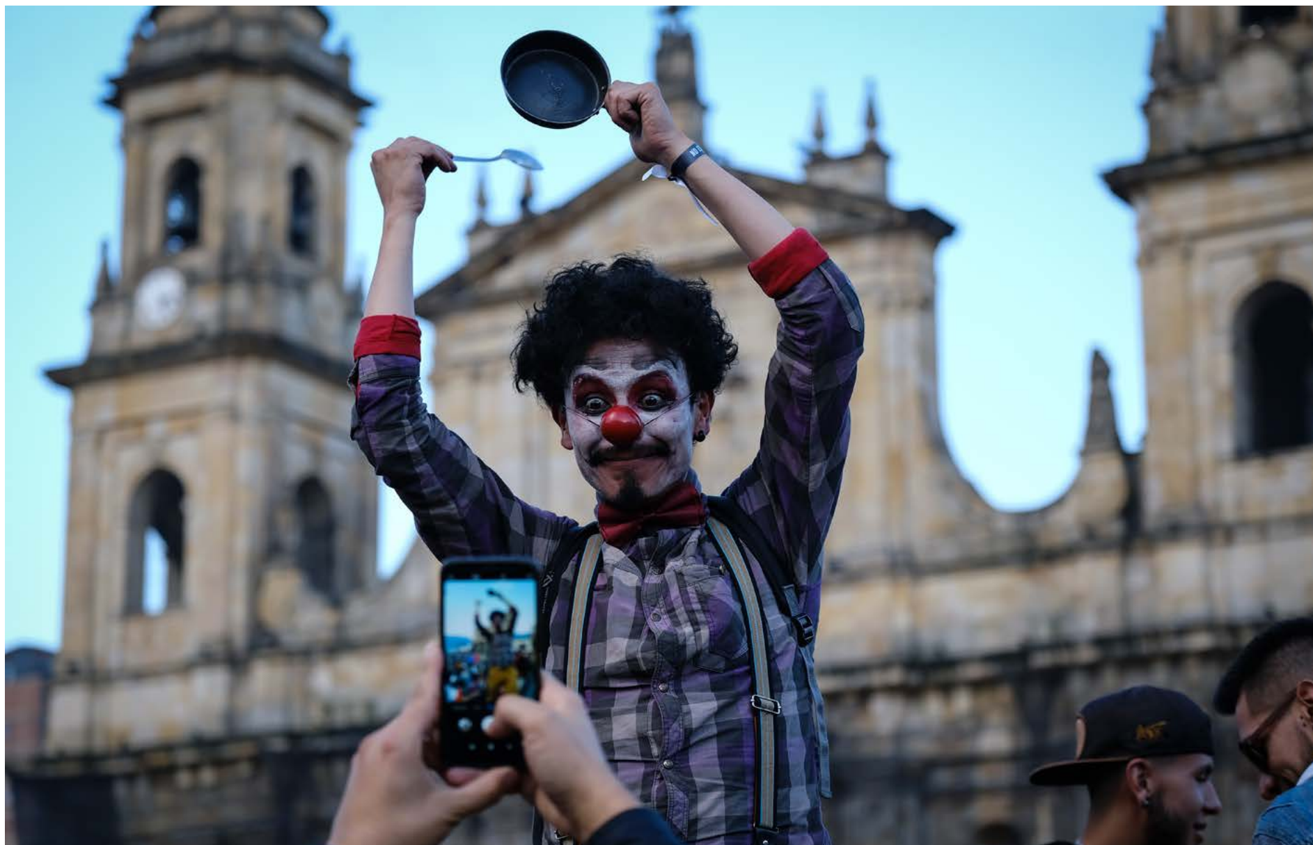
A protester dressed as a clown takes part in a demonstration against the government in Bogotá, Colombia.

PROTESTS IN CHILE, COLOMBIA, CUBA, ECUADOR, EGYPT, HAITI, IRAN, IRAQ, LEBANON AND ZIMBABWE