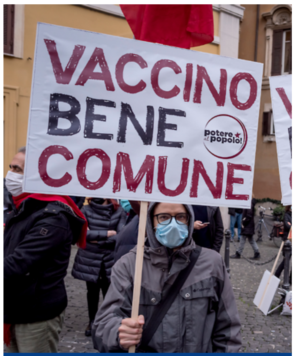
Protesters demand the free production of vaccines and their worldwide availability outside the Italian Parliament in Rome on 11 March 2021.

State after state asserted top-down, command-and-control approaches that seemed to show little trust in the wisdom of people and communities. The first instinct of many presidents and prime ministers was to act as though the pandemic was a threat to their power, rolling out well-rehearsed routines of repression. States took on broad emergency powers, and at least some clearly used the pandemic as a pretext to introduce rights restrictions that will last long after the crisis has passed. At a time when scrutiny was more difficult, the suspicion was that some political leaders were opportunistically consolidating their power, rushing through repressive measures they had long wanted to unleash.