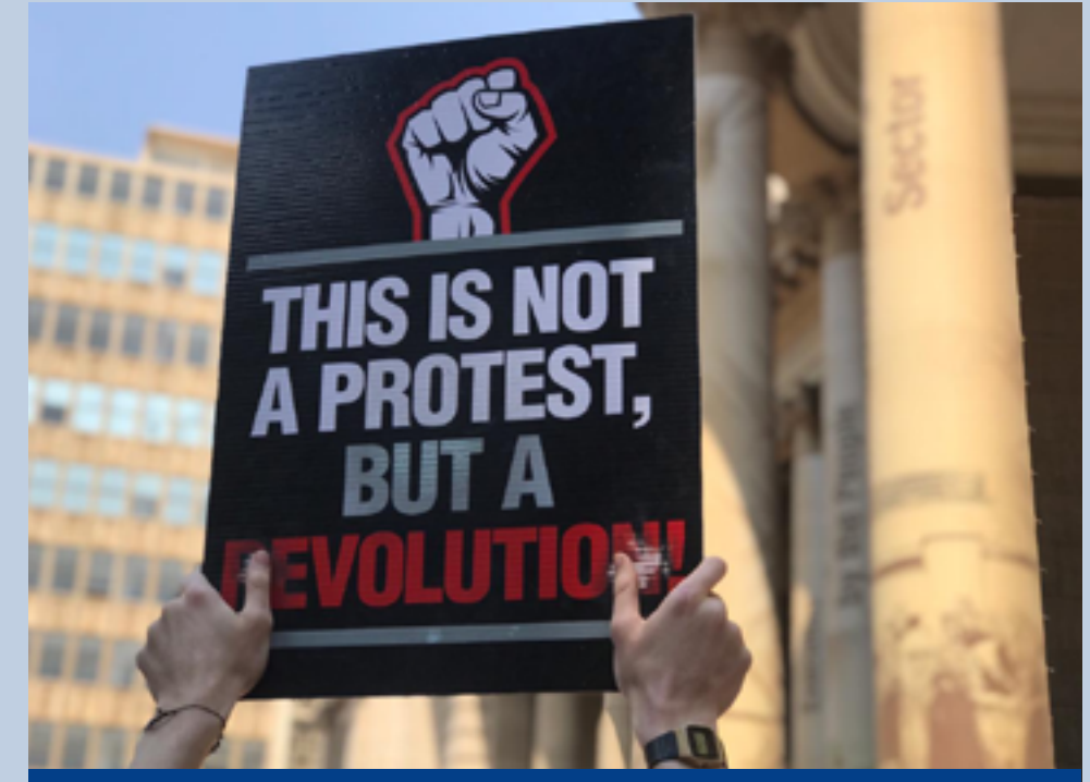
Climate march in Johannesburg, South Africa, September 2019.

What potential is there to renew civil society? How do conventional civil society models and approaches need to change and how can established civil society groups connect with protest energy, nurture participation journeys and help mobilisation achieve impact?