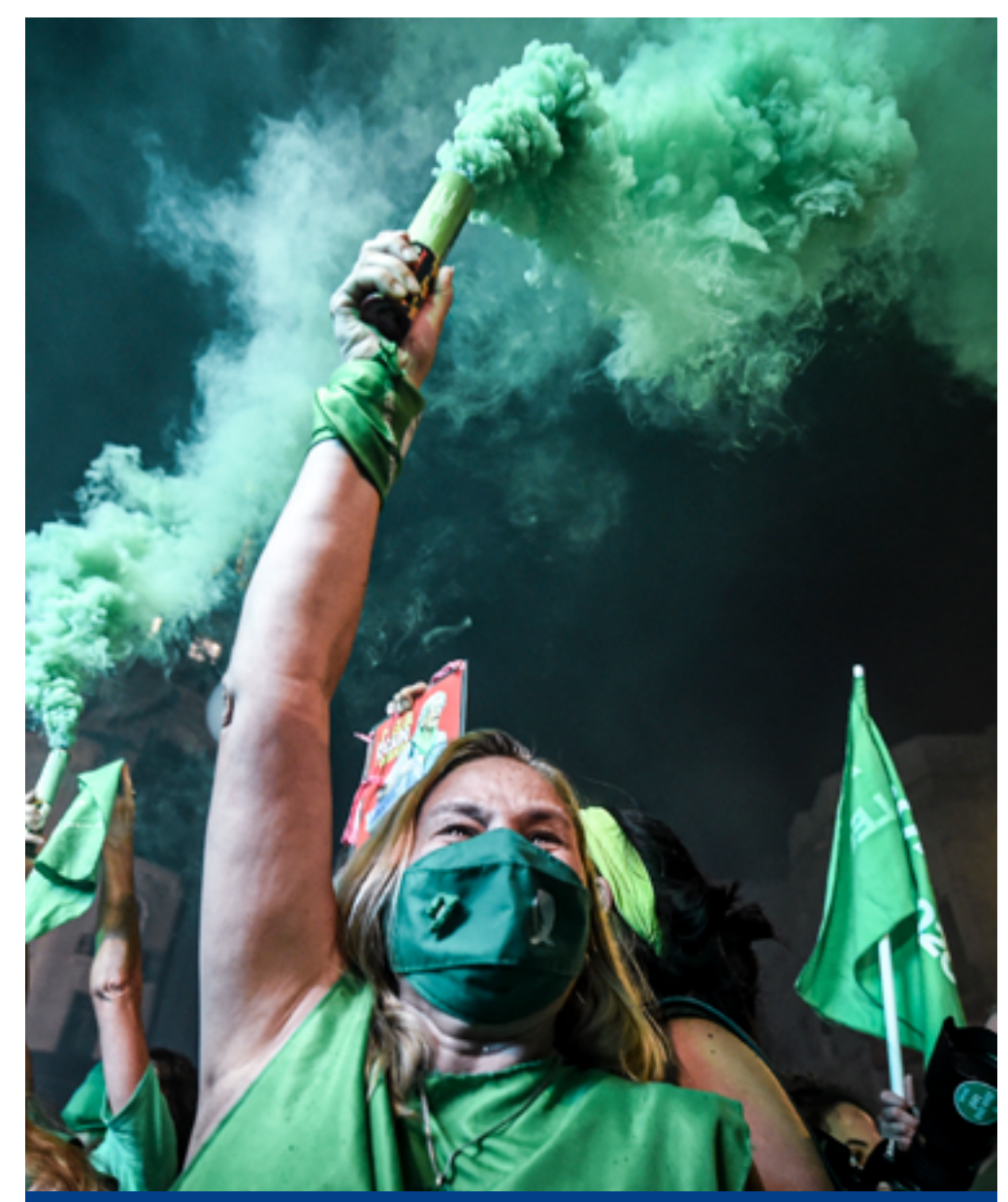
Pro-choice campaigners celebrate outside the National Congress in Buenos Aires, Argentina, as abortion is legalised on 30 December 2020.

of large-scale protests, on every inhabited continent, as people have risen up and defied attempts to repress them, to insist on human rights, democratic freedoms and equality, and demand gender, racial, economic, social and environmental justice. The history of these times is essentially that of an almighty tussle between the struggles of people's movements and the forces of repression, and while there have been setbacks aplenty there have also been moments of success.