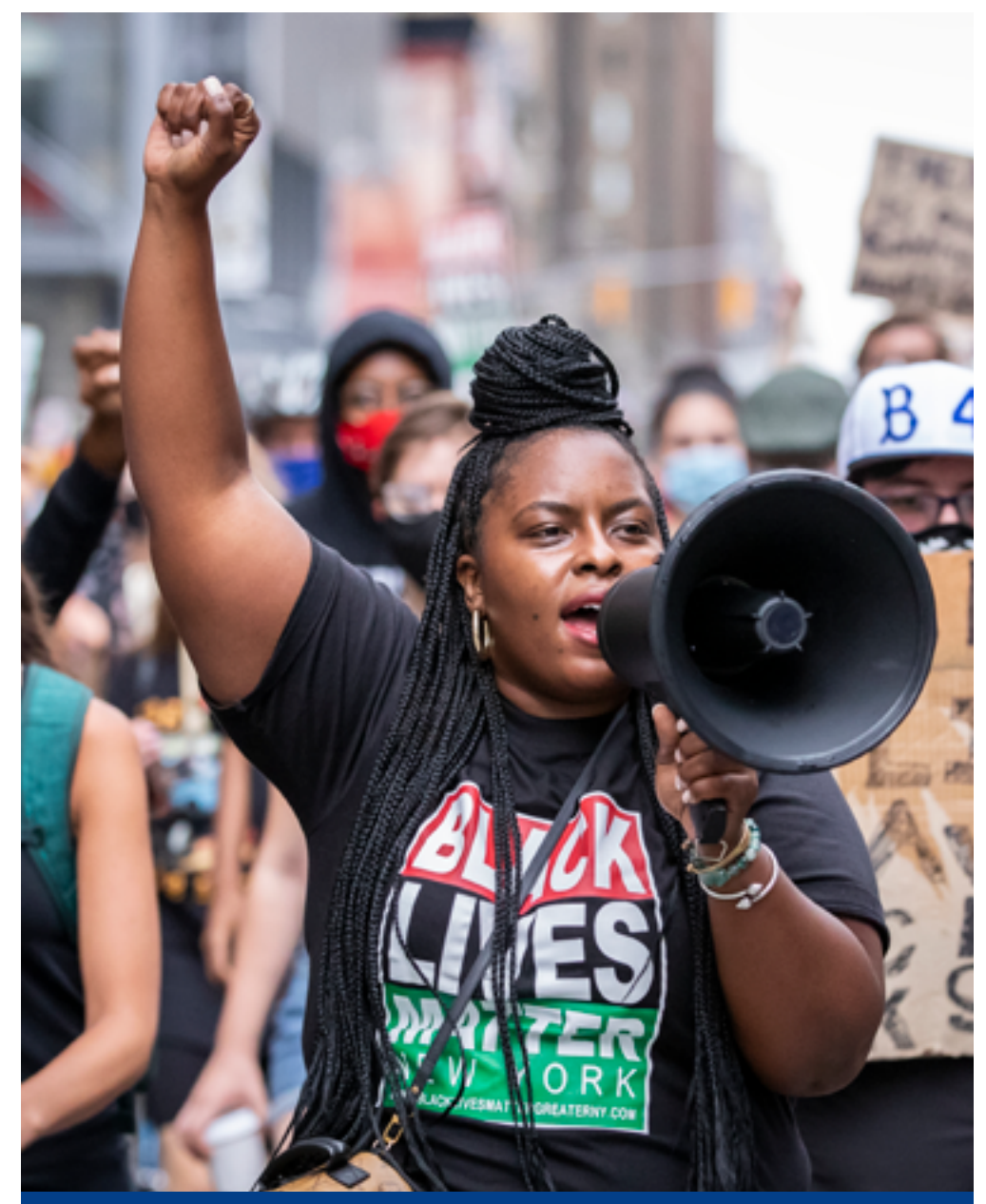
A Black Lives Matter organiser leads supporters in a march in New York City, USA, on 8 August 2020.

Alongside this, action continued to realise the rights of all groups that experience structural exclusion of the kind that deepened during the pandemic but long preceded it, including women and LGBTQI+ people, winning some important breakthroughs. In Chile, commitments to develop a new constitution through processes of deliberative democracy, won through concerted street-level protest, guaranteed gender parity and Indigenous representation. Abortion was legalised in Argentina. Same-sex relations were decriminalised in Bhutan and Gabon and same-sex marriage legalised